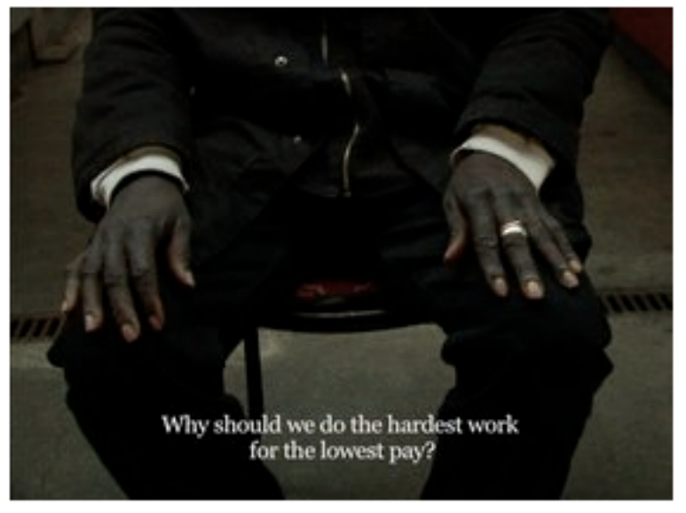
Bouchra Khalili, still from Speeches: Malcolm X, 2012, video, 6'30.

BK: It's such a complex process that it's impossible to describe it. I'm often asked how I meet the participants in my projects. It's a question I don't have a simple answer to, mostly because it's all mixed with life. I would not say that I find the subjects who participate in my projects but rather that I meet them and sometimes they find me, rather than I find them. The unexpected is a large part of the process. For example, there is no casting: I never start working on a project with the idea that I must meet an Algerian woman, or a Malian man. From the moment when the encounter occurs, we have a lot of conversations that are a way to learn how to speak to each other. This is an approach I have developed throughout the years to avoid pathos and sentimentality. For Speeches, it was a