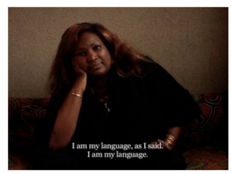
Bouchra Khalili, still from Speeches: Mahmoud Darwhish, 2012, video, 4'.

Bouchra Khalili: Dialects and languages - particularly the languages of minorities have played a prominent role in my work from the very beginning. Probably because one of my two mother tongues -Moroccan Arabic - which is called 'Darija' in Arabic, and that literally means 'dialect', is a subtle and complex mixture of Arabic, Berber language, French, and even sometimes Spanish. The ability of Moroccan dialect to appropriate and transform words from other languages is fascinating. When one uses sound and when one records words, language becomes fundamental: reveals anthropological and social realities, as well as a part of the colonial history, and one can still hear this in our language. But 'Darija' is also a language that is mostly used for oral communication.