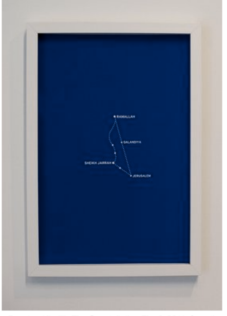
Bouchra Khalili, The Constellation Fig. 3, 2011, from the series The Constellation, silkscreen print mounted on aluminium and framed, 40cmX60cm.

BK: Not really. If one looks at this video installation from another perspective, one can see that just like in Wet Feet or in Anya (a single channel video I made in 2008), we are dealing with abandoned, deserted spaces, emptied of human life. There is a conceptual connection linking all of my work: it is still this idea that the invisible is an image, that sound is an image. In Circle Line, the scrolling subtitles are a sound - a 'silent sound' playing at an imaginary and mental level. Many of my videos also refer to the sea as metaphor and metonymy, of a passing space, a space that has no landmarks, a liquid labyrinth dedicated to drift and ultimately a metaphor of exile. But there is also this political dimension to the sea, which is more obvious to certain parts of the globe - it is also a cemetery containing the bodies of those who tried to cross it illegally: in the Strait of Gibraltar, off the Sicilian coast for example, also off Malta, off Greece on the borders with Turkey and in the Atlantic on the borders between the