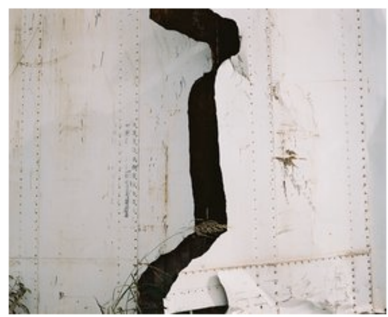
Bouchra Khalili, Wet Feet: Broken Container Fig. 1, 2012, C-Print, 120 X 100cm.

DS : In a very different series called Wet Feet (2012) you depict objects that refugees from Cuba and the Caribbean used to flee from their home countries to the US - things like containers, boats or floats. You use here the artistic tool of the 'blind spot' in photography, where you exclude the protagonist and leave it