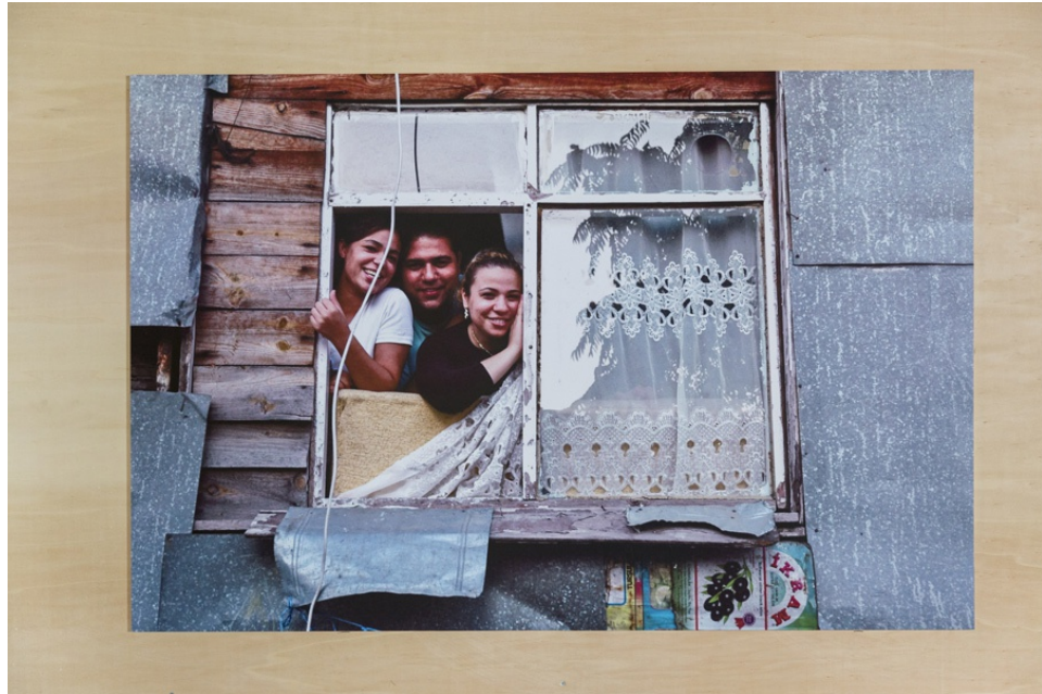
Research and archive material, photograph. Design: Zozan Kotan.

preparation period, some projects were lost and some major changes were made. But if you ask me if I am content with the biennial, yes I am.