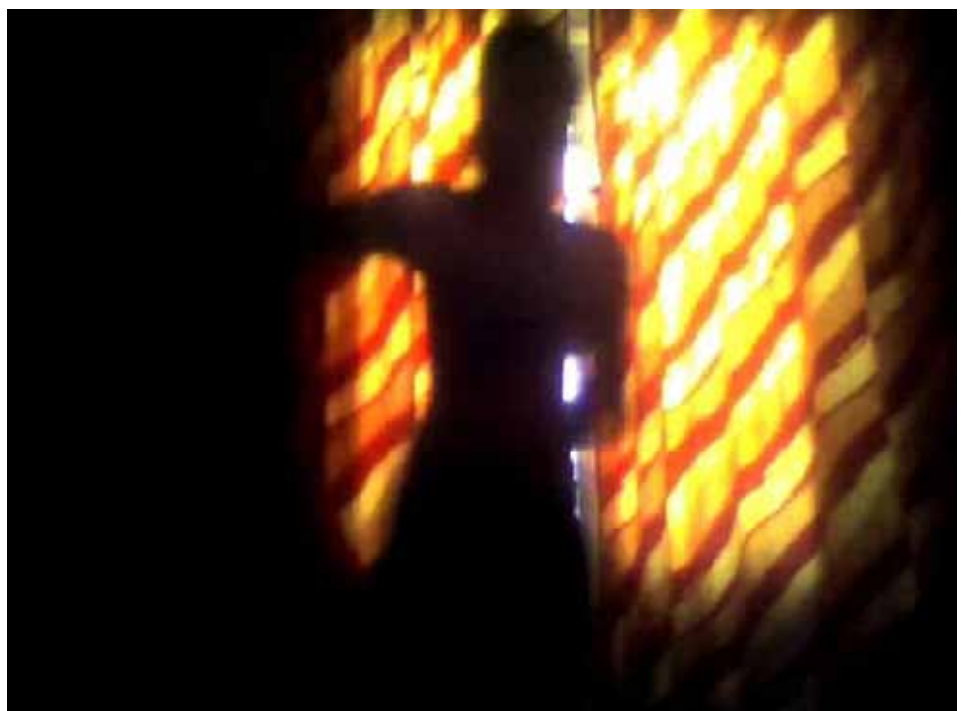
ismaël, Computers visions , 2008-ongoing, photographs taken by a webcam.

WG: Video never ceases to create different typologies in art, encapsulating the aesthetic tendencies of art movements from