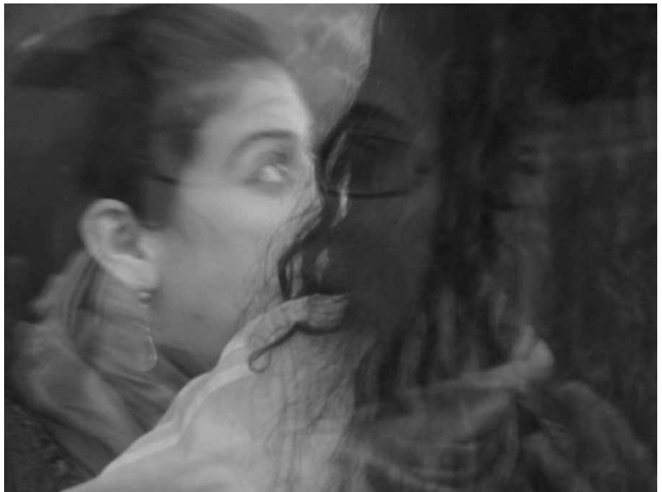
ismaël, Portraits series, 2008, digital photographs.

WG: What do you think of the term 'artist activist'?