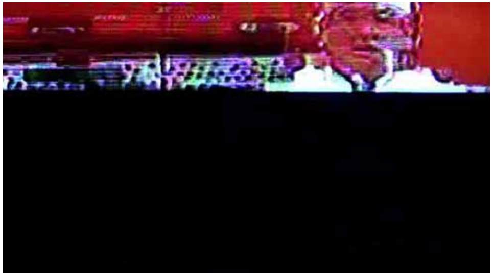
ismaël, Still from the video tv01 , 2010.

WG: Is the contingency between revolution and creation beneficial to you?