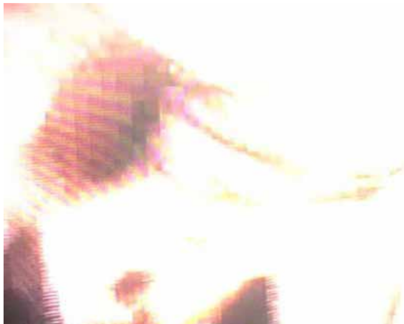
ismaël, Still from the video porn01 , 2010.

WG: What does a film manifesto mean to you? I refer to Godard's work, which became progressively deconstructed and that blended social and revolutionary themes. Does your work resemble Godard's themes?