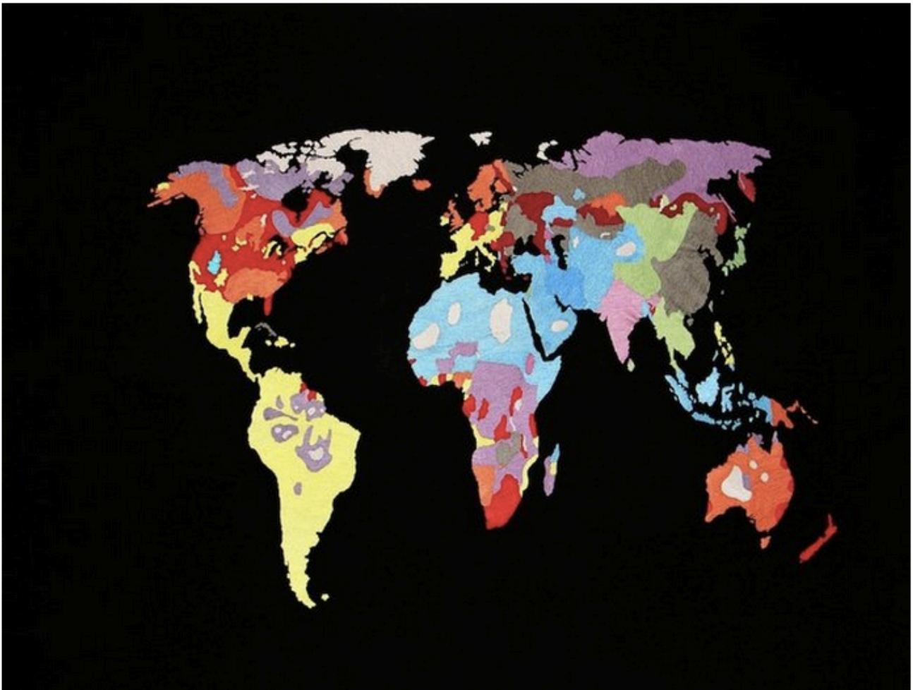
Yousef Moscatello, Map of Faith , 2012, embroidery, 100 x 130 cm. Courtesy of the artist.