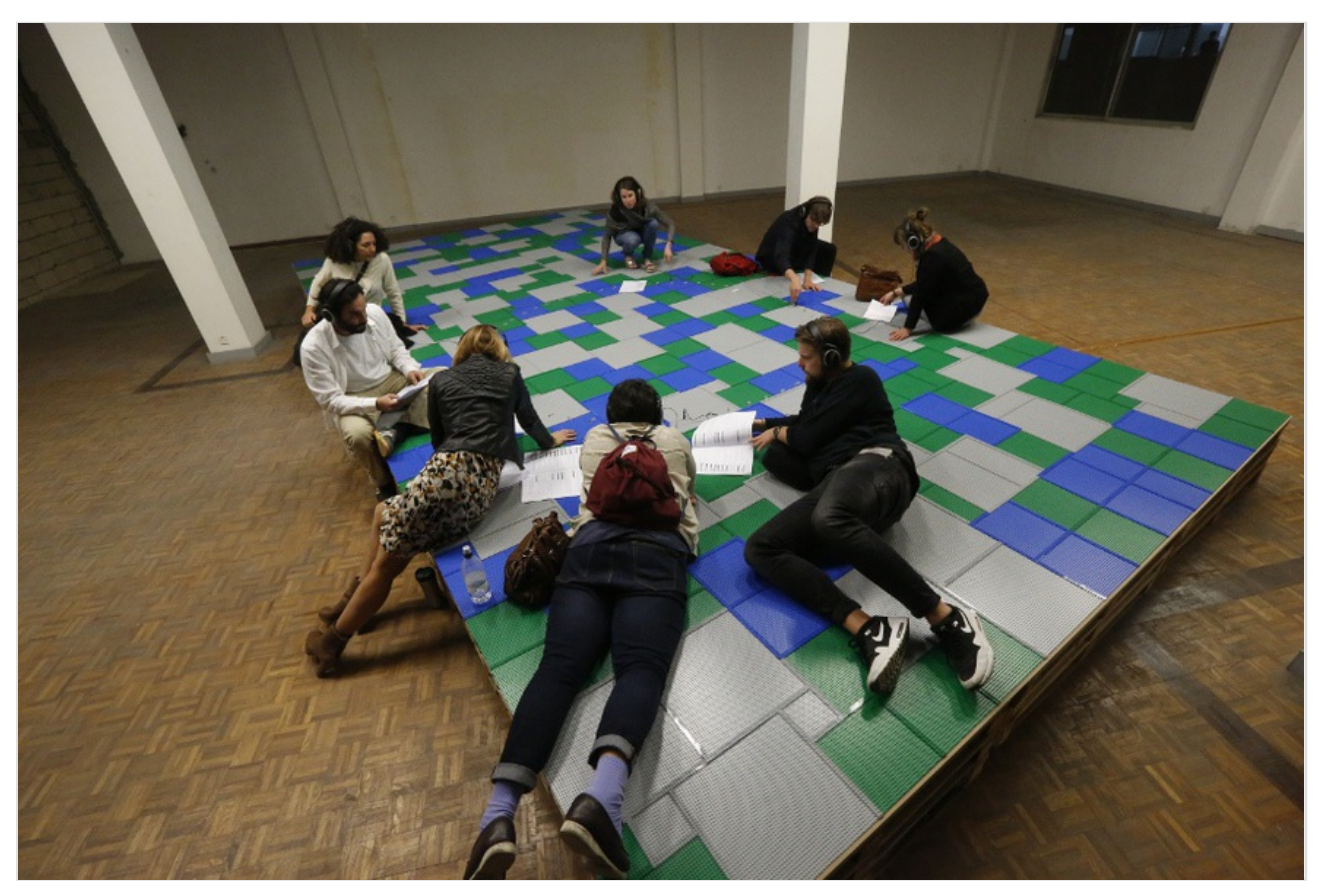
Natascha Sadr-Haghighian, pssst Leopard 2A7, 2013-ongoing. Installation view, Home Works 7 (November 11 – 24, 2015).

together and they make a great atomic collision, and some others come together and produce a structure that is polite and prim, and others do not work whatsoever and are redundant. We are not looking for beautiful shows or perfect conferences or symposia. The strength of Home Works is that it is not a biennale, it is not a conference; it is what comes out over a period of time – an accumulation. It's like a calendar.