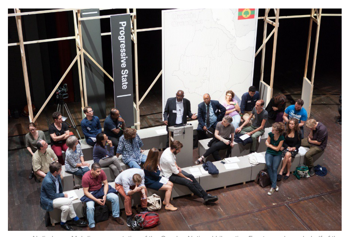
Abdirahman Mahdi, representative of the Ogaden National Liberation Front, speaks on behalf of the Oromo Liberation Front (OLF) in his lecture "A Criminal State: The Blacklisting of the Oromo Liberation Struggle for Freedom and Democracy.

framework? What is it that we can learn from these specific discourses? These questions responded to our own condition living in states creating its own states of exception, abandoning the rule of law. So what can we learn from those who have been placed outside of such a condition, and what is our indebtedness to these specific groups? This is actually how we got to know about the Kurdish Women's Movement in particular. We soon realised that the New World Summit should not be understood as a project, but rather as an endeavour with a much longer lifespan.