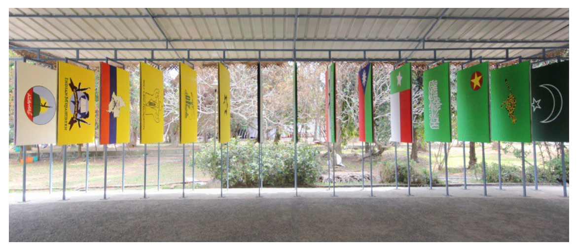
New World Summit – Kochi, 2013. Detail from the parliament of the 3rd New World Summit in Kochi, India, built as an extension of a former British colonial complex, showcasing panels with flags of organizations dealing with international blacklisting organized by color.

first summit, for instance, and the maps representing unrepresented states made for the fourth.