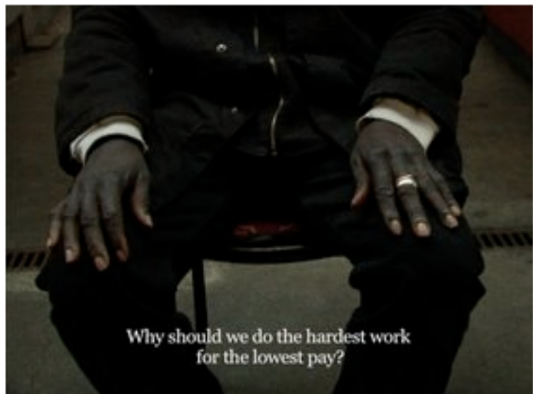
Bouchra Khalili, still from Speeches: Malcolm X , 2012, video, 6'30.

BK: It's such a complex process that it's impossible to describe it. I'm often asked how I meet the participants in my projects. It's a question I don't have a simple answer to, mostly because it's all mixed with life. I would not say that I find the subjects who participate in my projects but rather that I meet them and sometimes they find me, rather than I find them. The unexpected is a large part of the process. For example, there is no casting: I never start working on a project with the idea that I must meet an Algerian woman, or a Malian man. From the moment when the encounter occurs, we have a lot of conversations that are a way to learn how to speak to each other. This is an approach I have developed throughout the years to avoid pathos and sentimentality. For Speeches , it was a