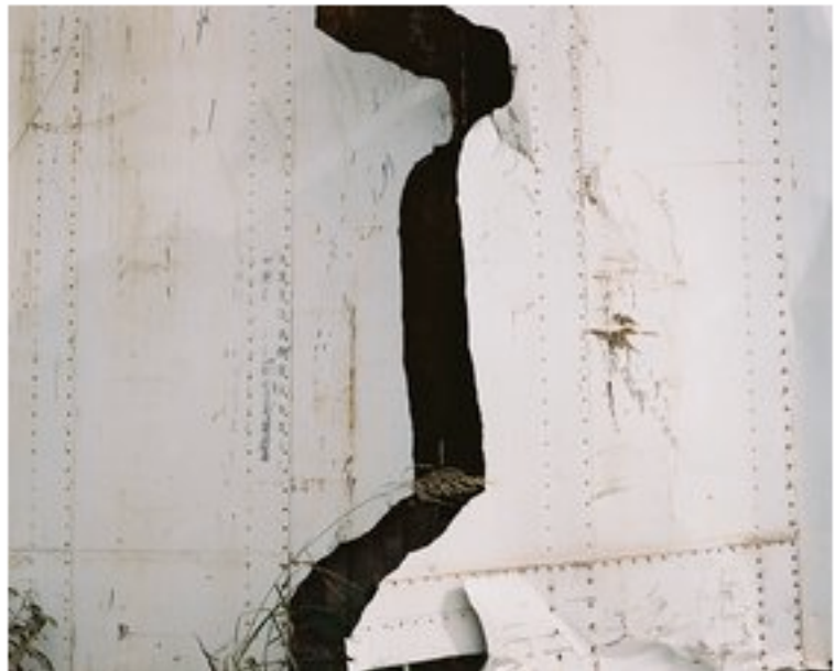
Bouchra Khalili, Wet Feet: Broken Container Fig. 1 , 2012, C-Print, 120 X 100cm.

DS: In a very different series called Wet Feet (2012) you depict objects that refugees from Cuba and the Caribbean used to flee from their home countries to the US - things like containers, boats or floats. You use here the artistic tool of the 'blind spot' in photography, where you exclude the protagonist and leave it