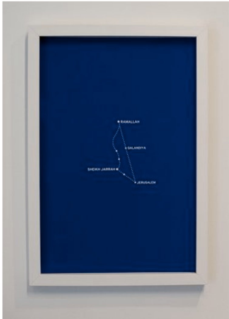
Bouchra Khalili, The Constellation Fig. 3 , 2011, from the series The Constellation , silkscreen print mounted on aluminium and framed, 40cmX60cm.

BK: Not really. If one looks at this video installation from another perspective, one can see that just like in Wet Feet or in Anya (a single channel video I made in 2008), we are dealing with abandoned, deserted spaces, emptied of human life. There is a conceptual connection linking all of my work: it is still this idea that the invisible is an image, that sound is an image. In Circle Line , the scrolling subtitles are a sound - a 'silent sound' - playing at an imaginary and mental level. Many of my videos also refer to the sea as metaphor and metonymy, of a passing space, a space that has no landmarks, a liquid labyrinth dedicated to drift and ultimately a metaphor of exile. But there is also this political dimension to the sea, which is more obvious to certain parts of the globe - it is also a cemetery containing the bodies of those who tried to cross it illegally: in the Strait of Gibraltar, off the Sicilian coast for example, also off Malta, off Greece on the borders with Turkey and in the Atlantic on the borders between the