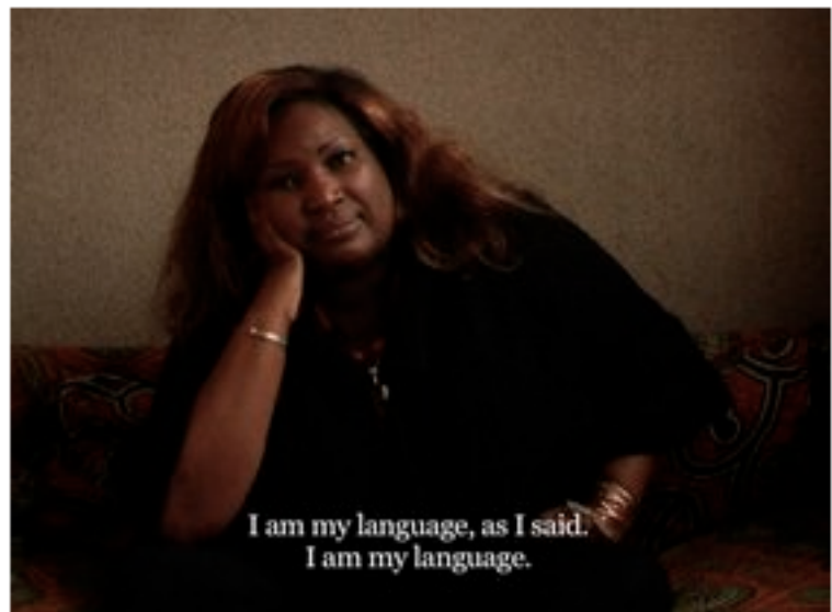
Bouchra Khalili, still from Speeches: Mahmoud Darwish , 2012, video, 4'.

Bouchra Khalili: Dialects and languages - particularly the languages of minorities - have played a prominent role in my work from the very beginning. Probably because one of my two mother tongues - Moroccan Arabic - which is called 'Darija' in Arabic, and that literally means 'dialect', is a subtle and complex mixture of Arabic, Berber language, French, and even sometimes Spanish. The ability of Moroccan dialect to appropriate and transform words from other languages is fascinating. When one uses sound and when one records words, language becomes fundamental; it reveals anthropological and social realities, as well as a part of the colonial history, and one can still hear this in our language. But 'Darija' is also a language that is mostly used for oral communication. Rarely written, it constantly changes and evolves. It is somehow a 'creole', as Édouard Glissant defines it: a