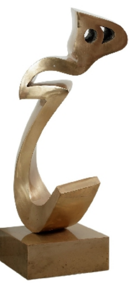
Parviz Tanavoli, Heech, 2008

In his studio called Atelier Kaboud, the artist Parviz Tanavoli discovered Heech . Heech was Tanavoli's protest against two trends in Iranian art at the time that were disturbing to him. One was the propensity to mimic the latest international art trends. The other was a fixation on calligraphic painting. Tanavoli decided he was going to limit himself to one word – heech , the Persian word for nothingness. The Afkhami collection contains several examples of Tanavoli's Heech sculptures.