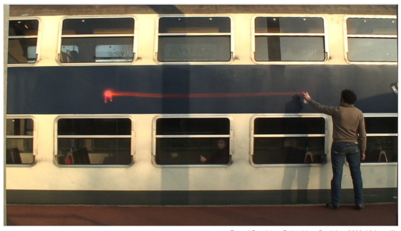
Fayçal Bagriche, Point, Line, Particles , 2008. Video still.

The research remit for Platform 009 addresses the following question: