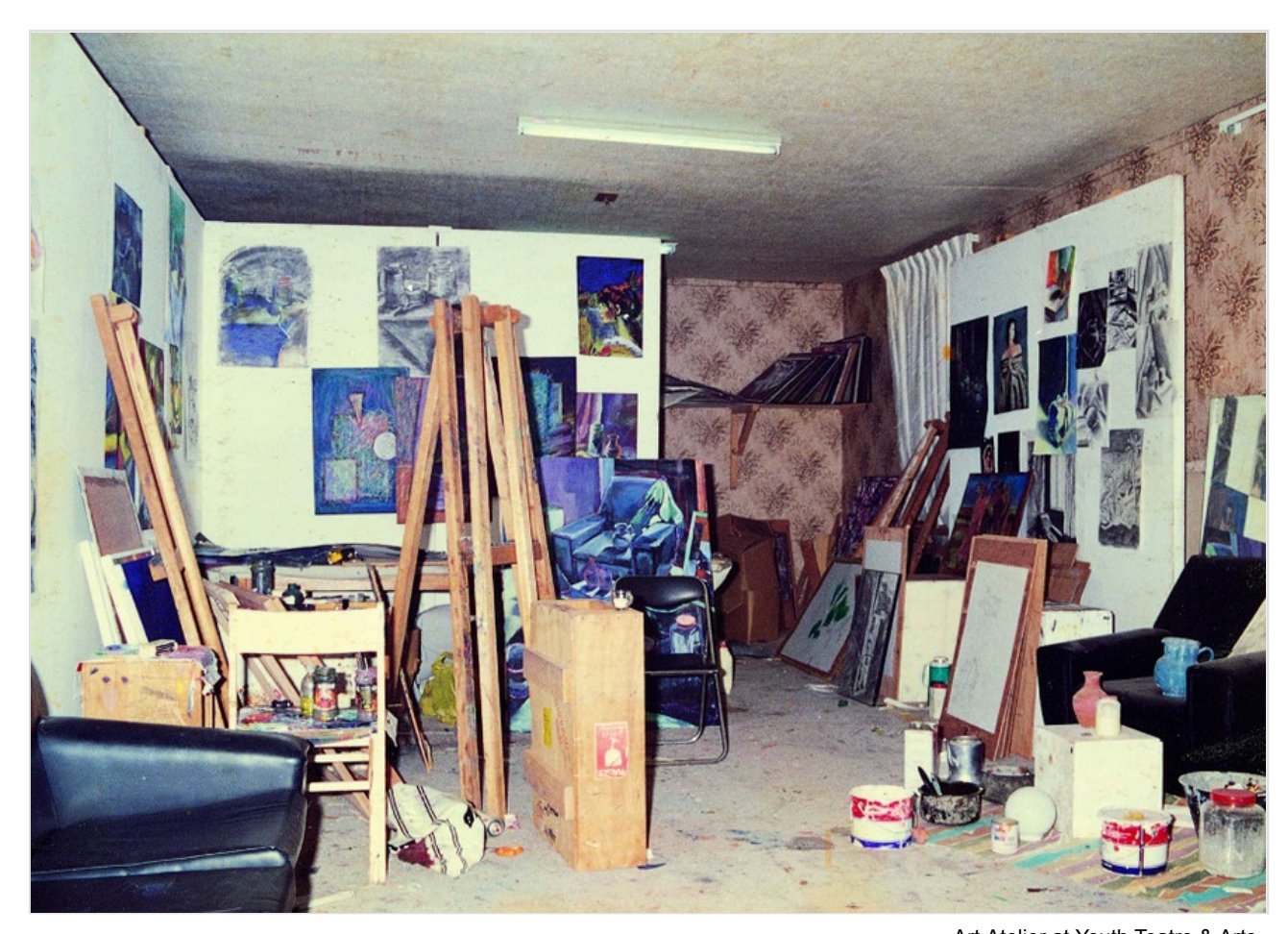
Art Atelier at Youth Teatre & Arts.

Performance art today, we quickly observed, sits at the nexus of a specific historical condition; one defined, in part at least, within the localized conditions of underfunding, under-investment, and an undervaluing of culture and its role in public space and social debate. To this, we need to also enquire into the global condition of visual culture against a backdrop of overt conflict and incipient unrest. Yet, if the performative gesture has become a barometer of sorts for the condition of visual culture and the conditions under which it continues to practice, then we should also note the relative lack of research into the formative practices of performative art. Where are the genealogies in a region that continues to have a complex and often fractious relationship to art histories in general?